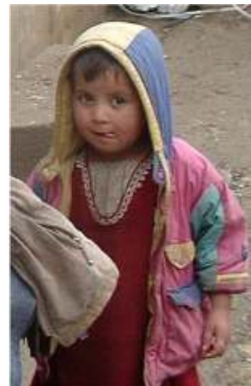
Waiting expectantly . . .