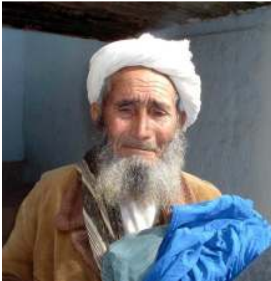
Grateful Old Man

much more to do. As you see the pictures of some who were at that distribution, would you join us