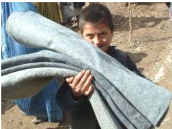
Smiling boy with an armload of blankets

to pray for the people of Afghanistan, and then generously send a donation for our next shipment? “The least of these”, and those who work with them, pray for your response.