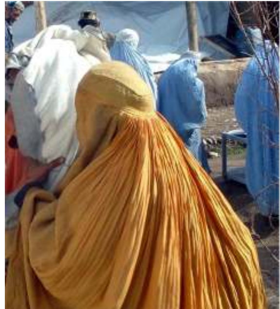
Afghani woman carries away clothes