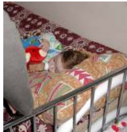
Russian orphan receives hope and help from Global

elementary students were reading! The Kinkade School held a Read-A-Thon and raised enough to bring smiles to hundreds of underprivileged children in a large orphanage in St. Petersburg. These students have learned how to ‘Give Children Hope’ by a tangible show of love and support on behalf of other children around the world. If you would like to host a similar program like this for hurting children in Russia, Iraq or Afghanistan, contact us - we’ll show you how to impact the world by reading!